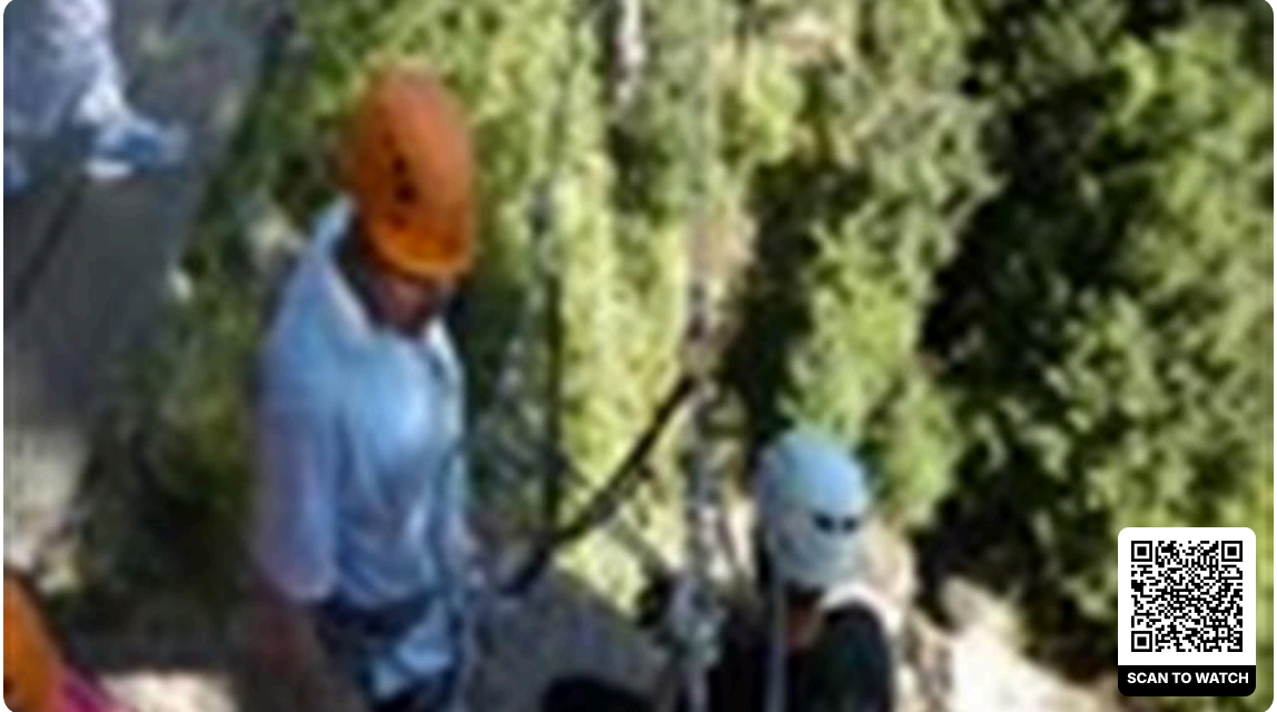
zipline in Canada